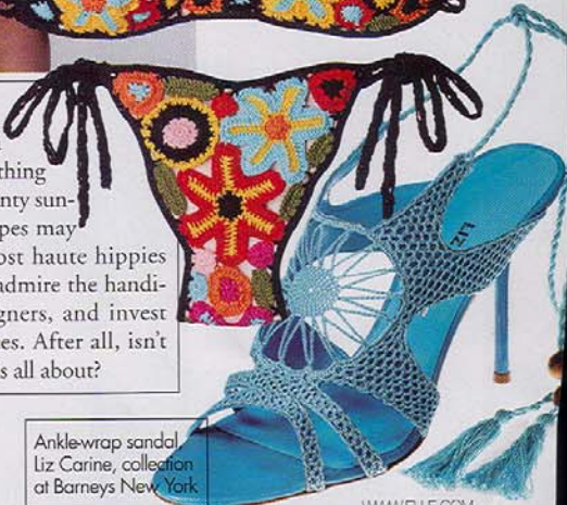
Ankle-wrap sandal, Liz Carine, collection at Barneys New York

Today crochet is experiencing a renaissance, appearing on everything from handbags and gloves to jaunty sundresses. And while creative types may enroll in crochet classes, most haute hippies will be satisfied to sit back, admire the handwork of our favorite designers, and invest in some of these key pieces. After all, isn't that what modern luxury is all about?