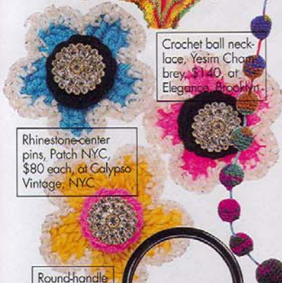
Rhinestone-center pins, Patch NYC, $80 each, at Calypso Vintage, NYC