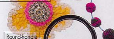
Round-handle bag, Isabella Fiore, $385, at Saks Fifth Avenue